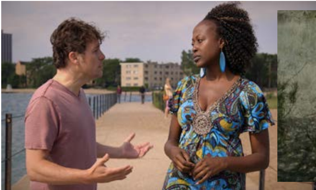
Left: Rogers Park