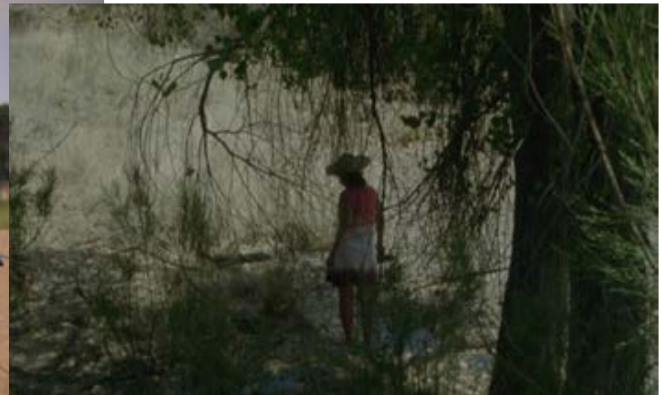
Right: EL MAR LA MAR